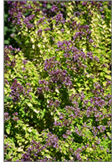
Drops of Jupiter Oregano flowers