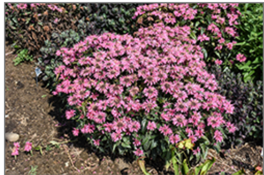
Upscale Pink Chenille Beebalm in bloom