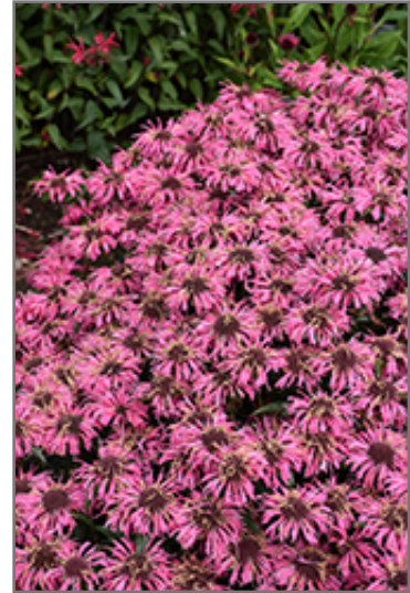
Upscale Pink Chenille Beebalm flowers

This plant will require occasional maintenance and upkeep, and should be cut back in late fall in preparation for winter. It is a good choice for attracting bees, butterflies and hummingbirds to your yard, but is not particularly attractive to deer who tend to leave it alone in favor of tastier treats. Gardeners should be aware of the following characteristic(s) that may warrant special consideration;