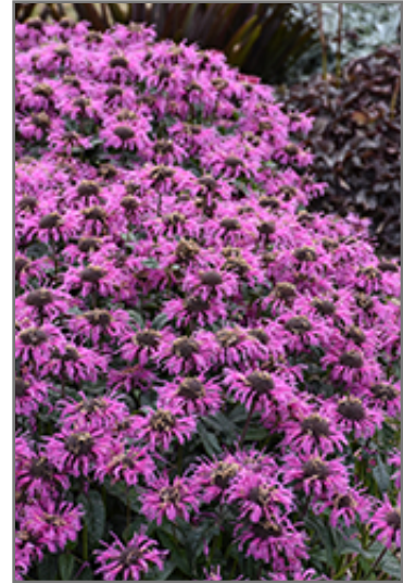
Upscale Lavender Taffeta Beebalm flowers

Upscale Lavender Taffeta Beebalm is recommended for the following landscape applications;