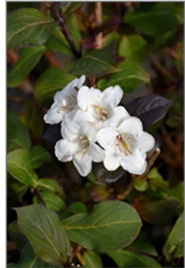
Wine & Spirits Weigela flowers