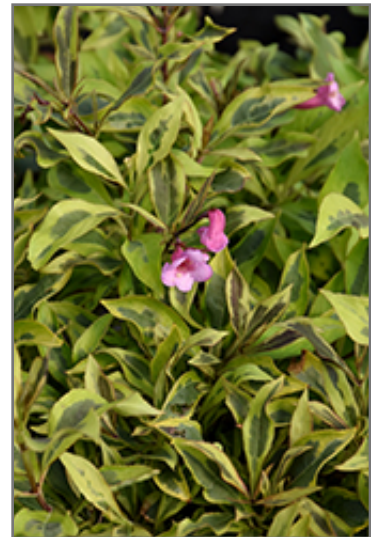
Bubbly Wine Weigela flowers