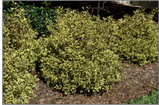
Bubbly Wine Weigela

Bubbly Wine Weigela makes a fine choice for the outdoor landscape, but it is also well-suited for use in outdoor pots and containers. It can be used either as 'filler' or as a 'thriller' in the 'spiller-thriller-filler' container combination, depending on the height and form of the other plants used in the container planting. It is even sizeable enough that it can be grown alone in a suitable container. Note that when grown in a container, it may not perform exactly as indicated on the tag - this is to be expected. Also note that when growing plants in outdoor containers and baskets, they may require more frequent waterings than they would in the yard or garden.