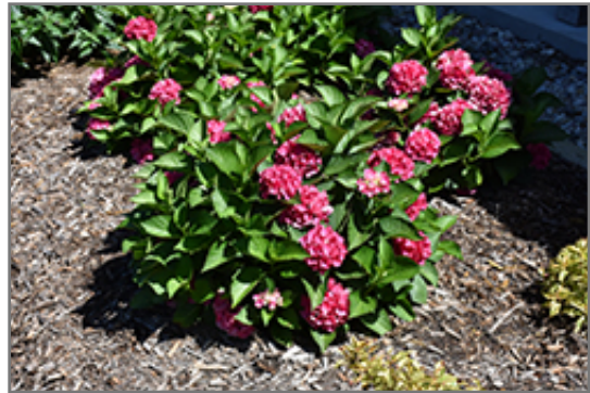
Wee Bit Giddy Hydrangea in bloom