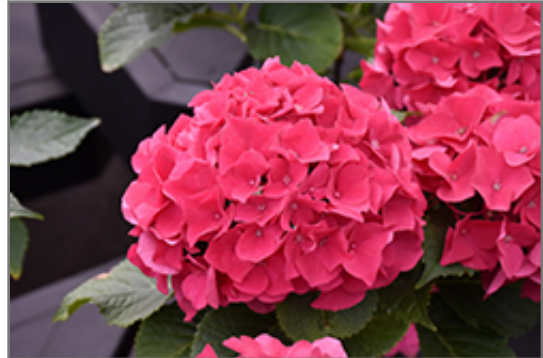
Wee Bit Giddy Hydrangea flowers

Wee Bit Giddy Hydrangea is recommended for the following landscape applications;