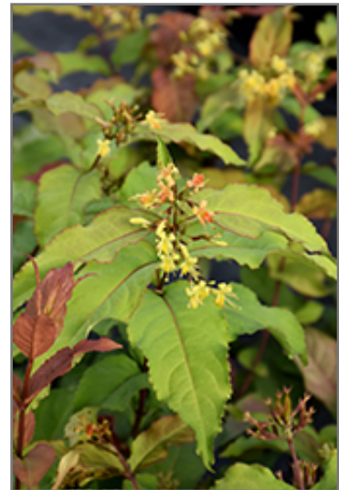
Kodiak Fresh Diervilla flowers