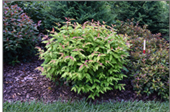
Kodiak Fresh Diervilla

Kodiak Fresh Diervilla makes a fine choice for the outdoor landscape, but it is also well-suited for use in outdoor pots and containers. Because of its height, it is often used as a 'thriller' in the 'spiller-thriller-filler' container combination; plant it near the center of the pot, surrounded by smaller plants and those that spill over the edges. It is even sizeable enough that it can be grown alone in a suitable container. Note that when grown in a container, it may not perform exactly as indicated on the tag - this is to be expected. Also note that when growing plants in outdoor containers and baskets, they may require more frequent waterings than they would in the yard or garden.