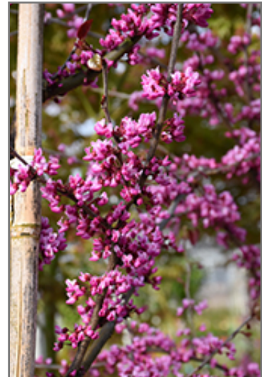
Midnight Express Redbud flowers