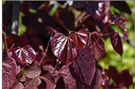
Midnight Express Redbud foliage

Midnight Express Redbud is recommended for the following landscape applications;