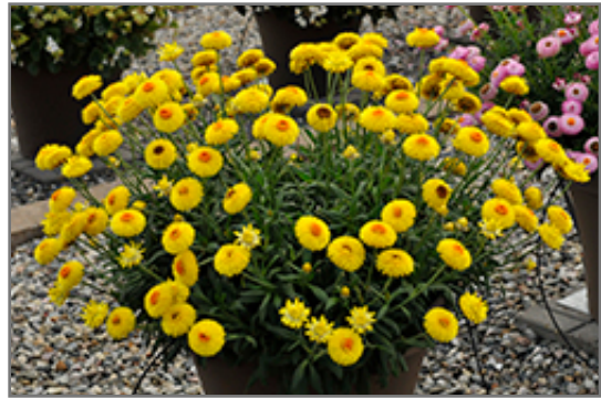
Granvia Gold Strawflower in bloom