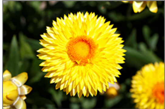
Granvia Gold Strawflower flowers

Granvia Gold Strawflower is recommended for the following landscape applications;