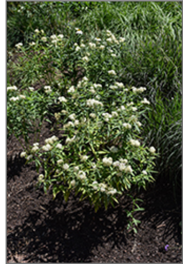
Ice Ballet Milkweed in bloom

This plant does best in full sun to partial shade. It is quite adaptable, preferring to grow in average to wet conditions, and will even tolerate some standing water. It is not particular as to soil type or pH. It is quite intolerant of urban pollution, therefore inner city or urban streetside plantings are best avoided. This is a selection of a native North American species. It can be propagated by division; however, as a cultivated variety, be aware that it may be subject to certain restrictions or prohibitions on propagation.