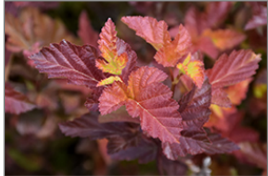
Center Glow Ninebark foliage