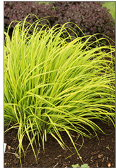
Prairie Winds Lemon Squeeze Fountain Grass