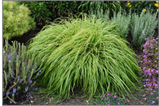
Prairie Winds Lemon Squeeze Fountain Grass

This is a relatively low maintenance plant, and is best cleaned up in early spring before it resumes active growth for the season. Deer don't particularly care for this plant and will usually leave it alone in favor of tastier treats. It has no significant negative characteristics.