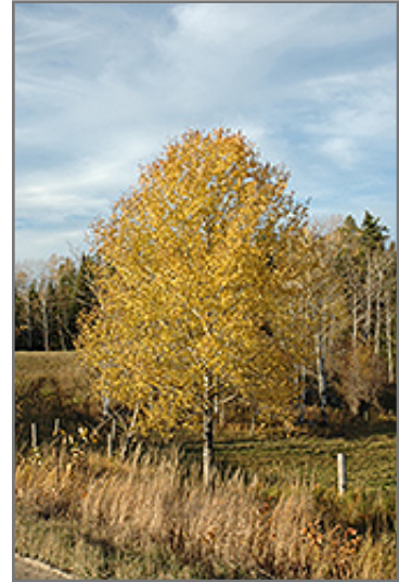
Trembling Aspen in fall

This tree should only be grown in full sunlight. It is an amazingly adaptable plant, tolerating both dry conditions and even some standing water. It is considered to be drought-tolerant, and thus makes an ideal choice for xeriscaping or the moisture-conserving landscape. It is not particular as to soil type or pH. It is quite intolerant of urban pollution, therefore inner city or urban streetside plantings are best avoided. This species is native to parts of North America.