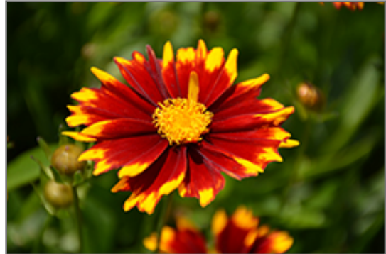
UpTick Red Tickseed flowers

UpTick Red Tickseed is a fine choice for the garden, but it is also a good selection for planting in outdoor pots and containers. It is often used as a 'filler' in the 'spiller-thriller-filler' container combination, providing a mass of flowers against which the thriller plants stand out. Note that when growing plants in outdoor containers and baskets, they may require more frequent waterings than they would in the yard or garden.