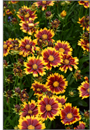
UpTick Red Tickseed flowers