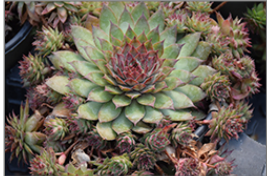
Chick Charms Butterscotch Baby Hens And Chicks