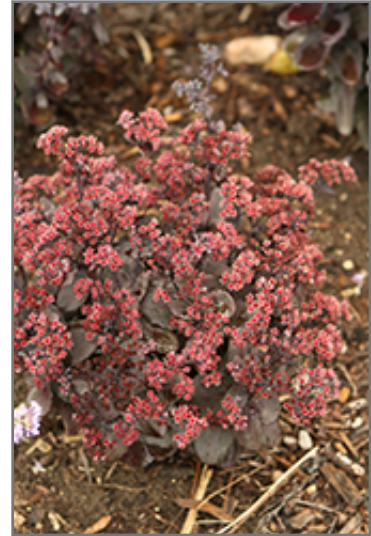
Rock 'N Grow Back in Black Stonecrop flowers

Rock 'N Grow Back in Black Stonecrop is a fine choice for the garden, but it is also a good selection for planting in outdoor pots and containers. With its upright habit of growth, it is best suited for use as a 'thriller' in the 'spiller-thriller-filler' container combination; plant it near the center of the pot, surrounded by smaller plants and those that spill over the edges. Note that when growing plants in outdoor containers and baskets, they may require more frequent waterings than they would in the yard or garden.