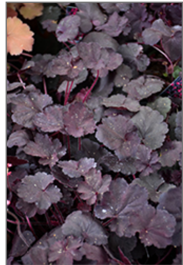
Black Forest Cake Coral Bells foliage