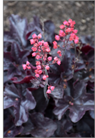
Black Forest Cake Coral Bells flowers

Black Forest Cake Coral Bells is recommended for the following landscape applications;