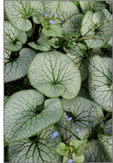
Sterling Silver Bugloss foliage

Sterling Silver Bugloss is a fine choice for the garden, but it is also a good selection for planting in outdoor pots and containers. It is often used as a 'filler' in the 'spiller-thriller-filler' container combination, providing a mass of flowers and foliage against which the thriller plants stand out. Note that when growing plants in outdoor containers and baskets, they may require more frequent waterings than they would in the yard or garden.