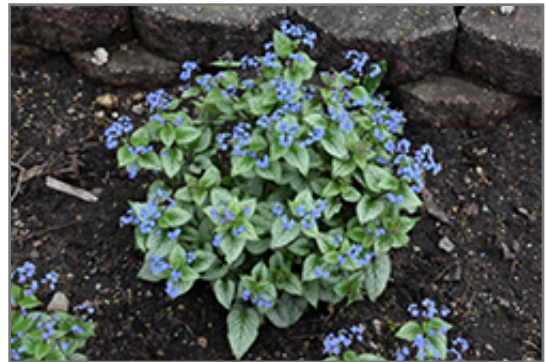
Sterling Silver Bugloss in bloom