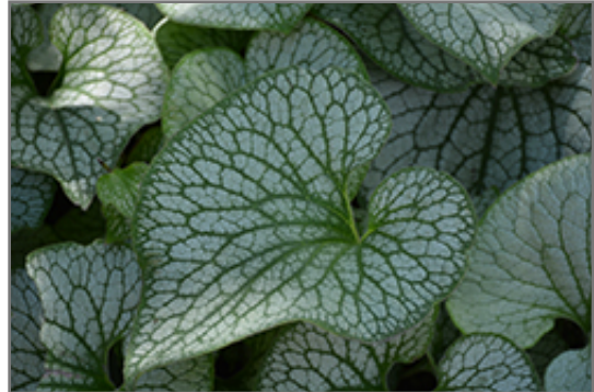
Sterling Silver Bugloss foliage

Sterling Silver Bugloss will grow to be about 12 inches tall at maturity, with a spread of 24 inches. When grown in masses or used as a bedding plant, individual plants should be spaced approximately 20 inches apart. It grows at a medium rate, and under ideal conditions can be expected to live for approximately 10 years. As an herbaceous perennial, this plant will usually die back to the crown each winter, and will regrow from the base each spring. Be careful not to disturb the crown in late winter when it may not be readily seen!