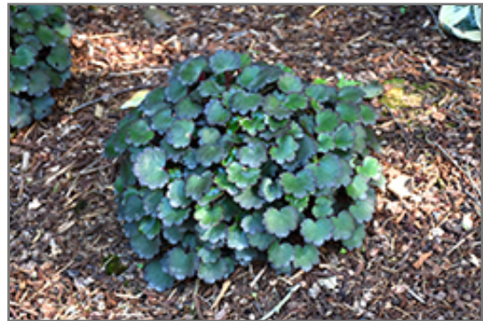
Pink Elf Saxifrage