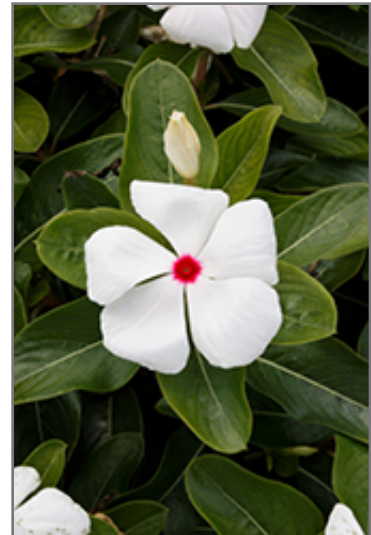
Cora Cascade Polka Dot Vinca flowers