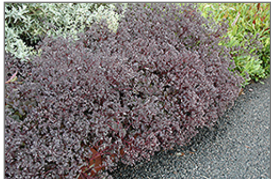
Bertram Anderson Stonecrop