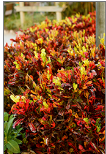
Mammy Croton foliage