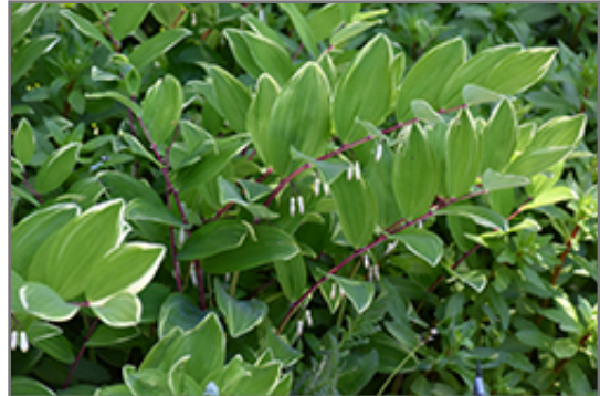
Variegated Solomon's Seal flowers