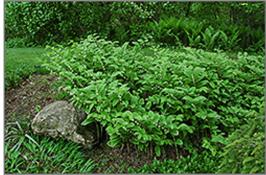
Variegated Solomon's Seal in bloom