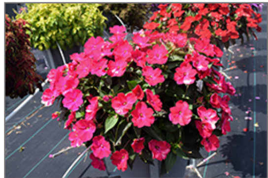
SunPatiens Compact Rose Glow New Guinea Impatiens in bloom