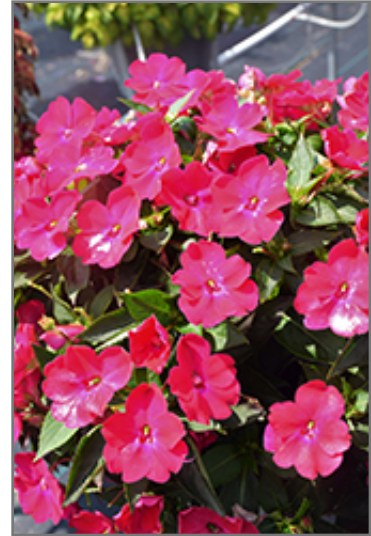
SunPatiens Compact Rose Glow New Guinea Impatiens flowers

SunPatiens Compact Rose Glow New Guinea Impatiens is a fine choice for the garden, but it is also a good selection for planting in outdoor containers and hanging baskets. It can be used either as 'filler' or as a 'thriller' in the 'spiller-thriller-filler' container combination, depending on the height and form of the other plants used in the container planting. It is even sizeable enough that it can be grown alone in a suitable container. Note that when growing plants in outdoor containers and baskets, they may require more frequent waterings than they would in the yard or garden.