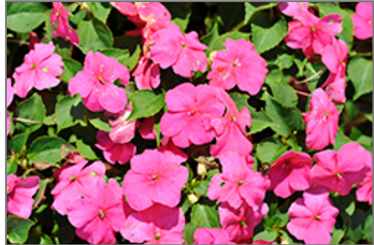
Beacon Rose Impatiens flowers