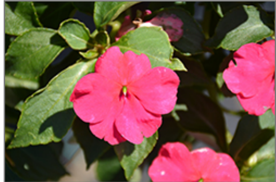
Beacon Rose Impatiens flowers

Beacon Rose Impatiens is a fine choice for the garden, but it is also a good selection for planting in outdoor containers and hanging baskets. It is often used as a 'filler' in the 'spiller-thriller-filler' container combination, providing a mass of flowers against which the thriller plants stand out. Note that when growing plants in outdoor containers and baskets, they may require more frequent waterings than they would in the yard or garden.