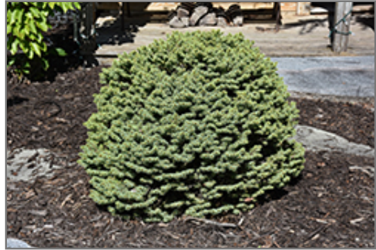
Dwarf Serbian Spruce