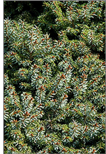
Dwarf Serbian Spruce foliage