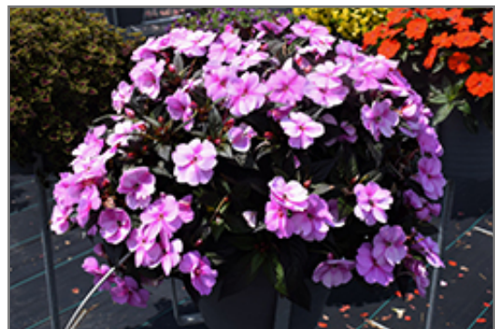
SunPatiens Vigorous Lavender Splash New Guinea Impatiens in bloom