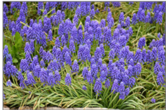
Grape Hyacinth in bloom