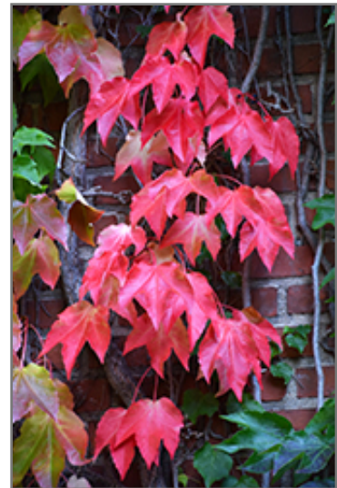
Boston Ivy in fall