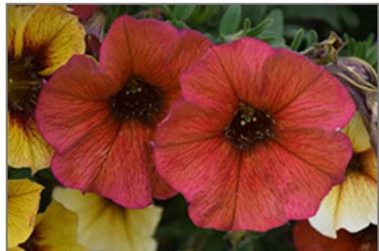
SuperCal Premium Cinnamon Petchoa flowers