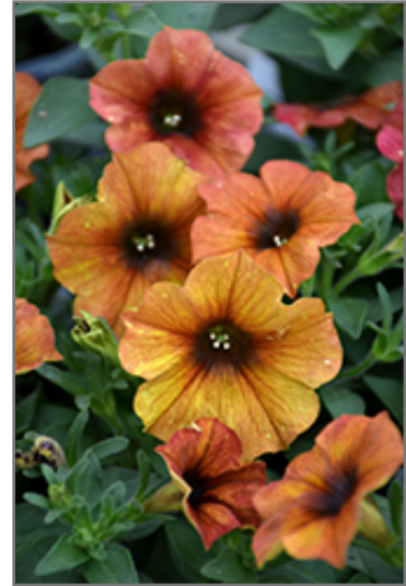
SuperCal Premium Cinnamon Petchoa flowers

SuperCal Premium Cinnamon Petchoa is recommended for the following landscape applications;