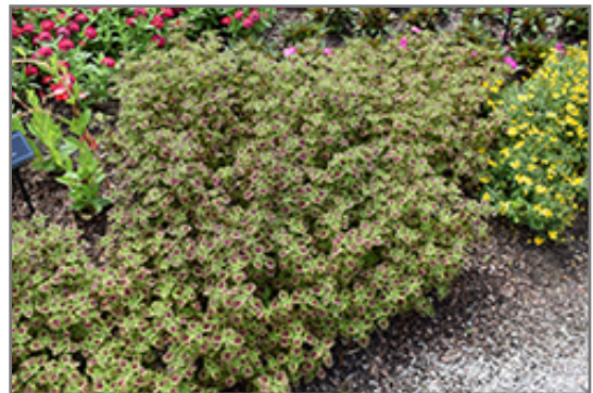
ColorBlaze Chocolate Drop Coleus