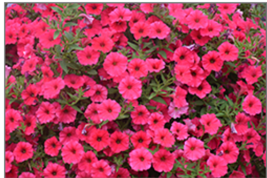
Supertunia Vista Paradise Petunia flowers