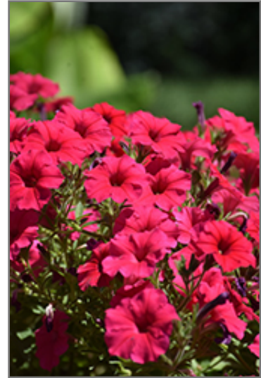
Supertunia Vista Paradise Petunia flowers

This plant will require occasional maintenance and upkeep. Trim off the flower heads after they fade and die to encourage more blooms late into the season. It is a good choice for attracting butterflies and hummingbirds to your yard, but is not particularly attractive to deer who tend to leave it alone in favor of tastier treats. It has no significant negative characteristics.