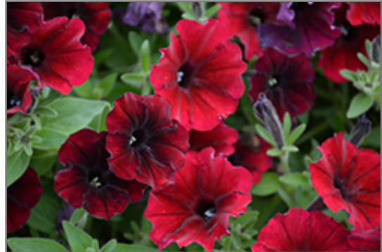
Supertunia Black Cherry Petunia flowers

Supertunia Black Cherry Petunia is a fine choice for the garden, but it is also a good selection for planting in outdoor containers and hanging baskets. Because of its trailing habit of growth, it is ideally suited for use as a 'spiller' in the 'spiller-thriller-filler' container combination; plant it near the edges where it can spill gracefully over the pot. Note that when growing plants in outdoor containers and baskets, they may require more frequent waterings than they would in the yard or garden.