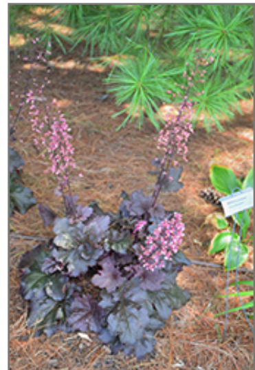
Primo Mahogany Monster Coral Bells in bloom