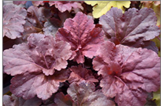
Primo Mahogany Monster Coral Bells foliage

Primo Mahogany Monster Coral Bells is a fine choice for the garden, but it is also a good selection for planting in outdoor pots and containers. With its upright habit of growth, it is best suited for use as a 'thriller' in the 'spiller-thriller-filler' container combination; plant it near the center of the pot, surrounded by smaller plants and those that spill over the edges. Note that when growing plants in outdoor containers and baskets, they may require more frequent waterings than they would in the yard or garden.