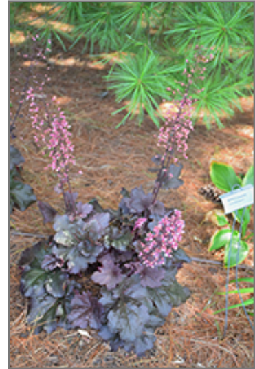
Primo Mahogany Monster Coral Bells in bloom

Primo Mahogany Monster Coral Bells will grow to be about 16 inches tall at maturity extending to 3 feet tall with the flowers, with a spread of 28 inches. When grown in masses or used as a bedding plant, individual plants should be spaced approximately 24 inches apart. Its foliage tends to remain dense right to the ground, not requiring facer plants in front. It grows at a medium rate, and under ideal conditions can be expected to live for approximately 10 years. As an evergreen perennial, this plant will typically keep its form and foliage year-round.