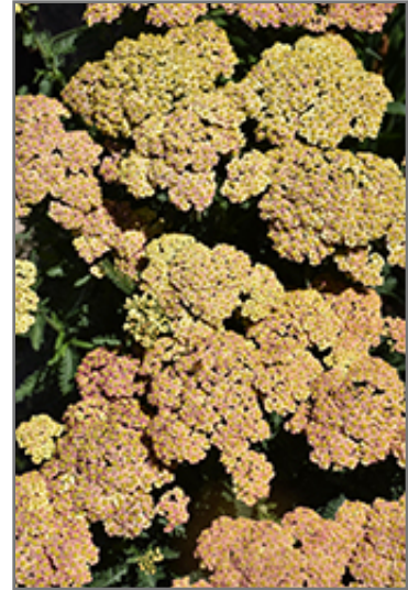
Firefly Peach Sky Yarrow flowers

Firefly Peach Sky Yarrow is recommended for the following landscape applications;