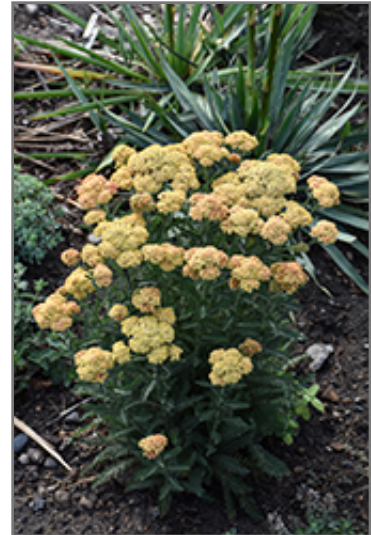
Firefly Peach Sky Yarrow in bloom