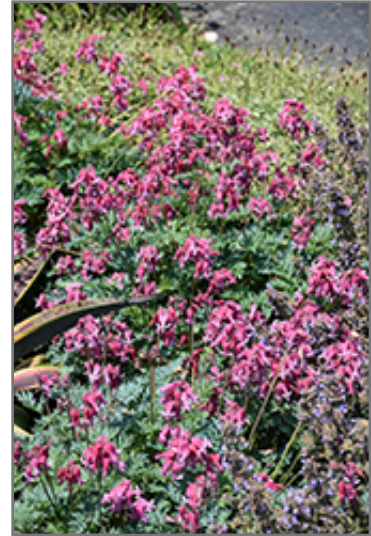
Pink Diamonds Fern-leaved Bleeding Heart flowers

This plant will require occasional maintenance and upkeep, and should be cut back in late fall in preparation for winter. It is a good choice for attracting butterflies to your yard, but is not particularly attractive to deer who tend to leave it alone in favor of tastier treats. It has no significant negative characteristics.