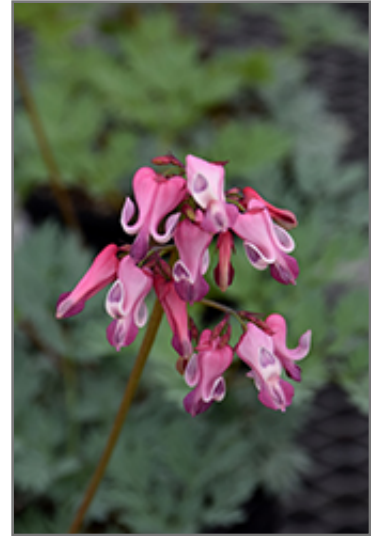
Pink Diamonds Fern-leaved Bleeding Heart flowers

Pink Diamonds Fern-leaved Bleeding Heart is a fine choice for the garden, but it is also a good selection for planting in outdoor pots and containers. It is often used as a 'filler' in the 'spiller-thriller-filler' container combination, providing a mass of flowers and foliage against which the thriller plants stand out. Note that when growing plants in outdoor containers and baskets, they may require more frequent waterings than they would in the yard or garden.