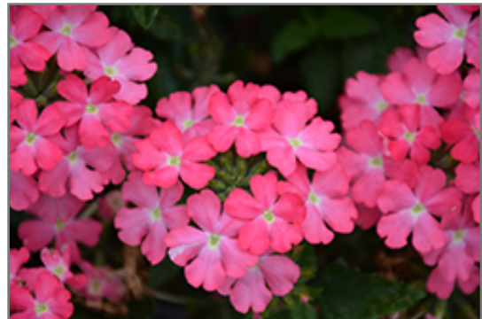
Firehouse Pink Verbena flowers