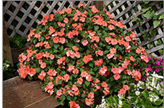
Beacon Salmon Impatiens in bloom

Beacon Salmon Impatiens is recommended for the following landscape applications;