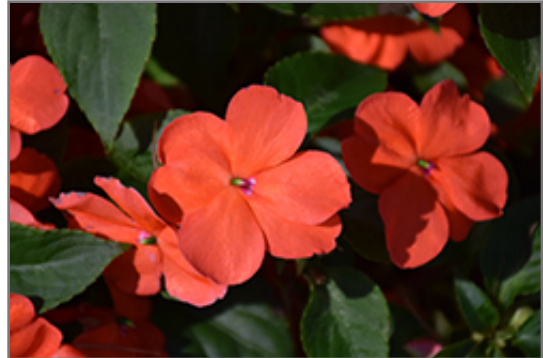
Beacon Salmon Impatiens flowers

Beacon Salmon Impatiens will grow to be about 15 inches tall at maturity, with a spread of 12 inches. When grown in masses or used as a bedding plant, individual plants should be spaced approximately 8 inches apart. Its foliage tends to remain dense right to the ground, not requiring facer plants in front. This fast-growing annual will normally live for one full growing season, needing replacement the following year.