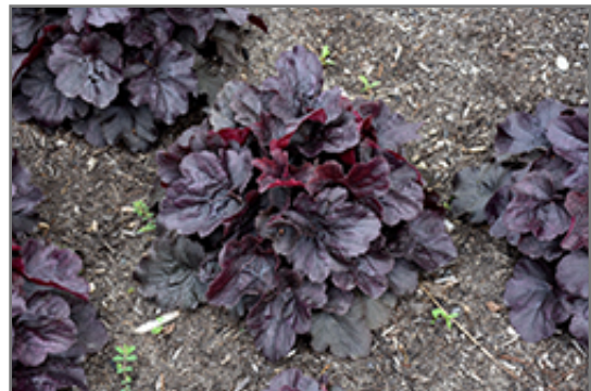
Northern Exposure Black Coral Bells