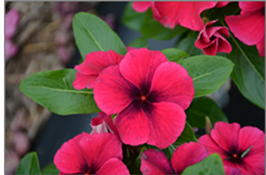
Tattoo Black Cherry Vinca flowers

Tattoo Black Cherry Vinca is recommended for the following landscape applications;