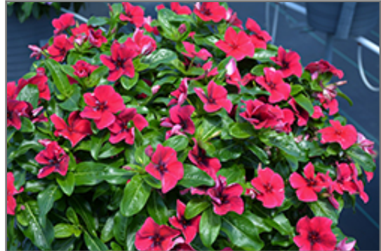
Tattoo Black Cherry Vinca in bloom

Tattoo Black Cherry Vinca will grow to be about 12 inches tall at maturity, with a spread of 8 inches. When grown in masses or used as a bedding plant, individual plants should be spaced approximately 6 inches apart. Its foliage tends to remain dense right to the ground, not requiring facer plants in front. Although it's not a true annual, this fast-growing plant can be expected to behave as an annual in our climate if left outdoors over the winter, usually needing replacement the following year. As such, gardeners should take into consideration that it will perform differently than it would in its native habitat.