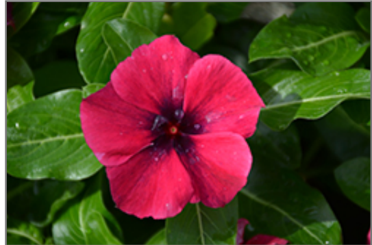
Tattoo Black Cherry Vinca flowers

Tattoo Black Cherry Vinca is recommended for the following landscape applications;