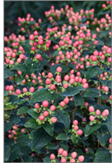
FloralBerry Rosé St. John's Wort fruit

FloralBerry Rosé St. John's Wort is recommended for the following landscape applications;