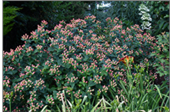
FloralBerry Rosé St. John's Wort fruit

FloralBerry Rosé St. John's Wort will grow to be about 3 feet tall at maturity, with a spread of 3 feet. It tends to fill out right to the ground and therefore doesn't necessarily require facer plants in front. It grows at a medium rate, and under ideal conditions can be expected to live for approximately 5 years. This is a self-pollinating variety, so it doesn't require a second plant nearby to set fruit.