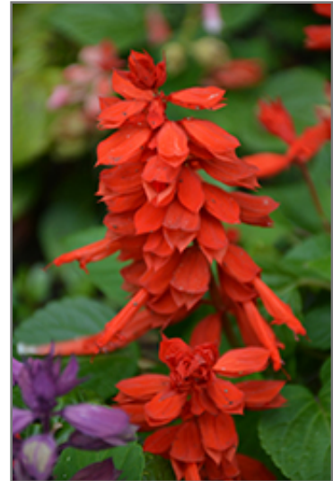
Vista Red Sage flowers