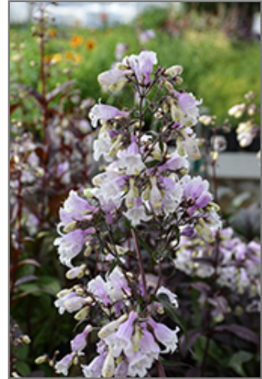
Pocahontas Beard Tongue flowers

Pocahontas Beard Tongue is recommended for the following landscape applications;