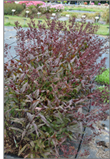
Pocahontas Beard Tongue

Pocahontas Beard Tongue is a fine choice for the garden, but it is also a good selection for planting in outdoor pots and containers. With its upright habit of growth, it is best suited for use as a 'thriller' in the 'spiller-thriller-filler' container combination; plant it near the center of the pot, surrounded by smaller plants and those that spill over the edges. It is even sizeable enough that it can be grown alone in a suitable container. Note that when growing plants in outdoor containers and baskets, they may require more frequent waterings than they would in the yard or garden.