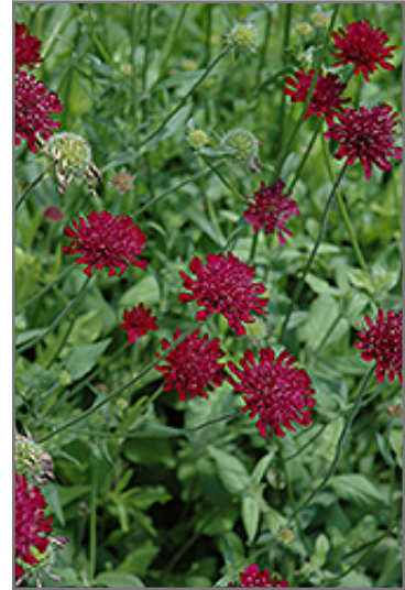
Crimson Scabious flowers

Crimson Scabious will grow to be about 24 inches tall at maturity extending to 3 feet tall with the flowers, with a spread of 24 inches. It tends to be leggy, with a typical clearance of 1 foot from the ground, and should be underplanted with lower-growing perennials. It grows at a fast rate, and under ideal conditions can be expected to live for approximately 3 years. As an herbaceous perennial, this plant will usually die back to the crown each winter, and will regrow from the base each spring. Be careful not to disturb the crown in late winter when it may not be readily seen!