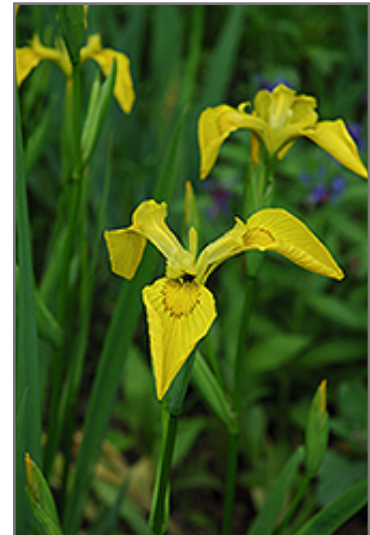
Yellow Flag Iris flowers