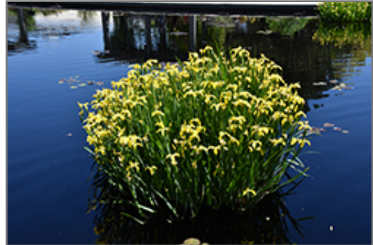
Yellow Flag Iris in bloom