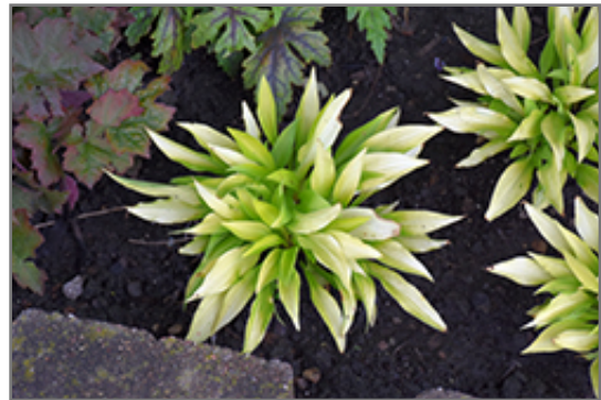
Munchkin Fire Hosta