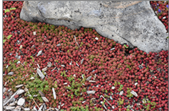
Coral Carpet Stonecrop

Coral Carpet Stonecrop is a dense herbaceous evergreen perennial with a ground-hugging habit of growth. Its medium texture blends into the garden, but can always be balanced by a couple of finer or coarser plants for an effective composition.