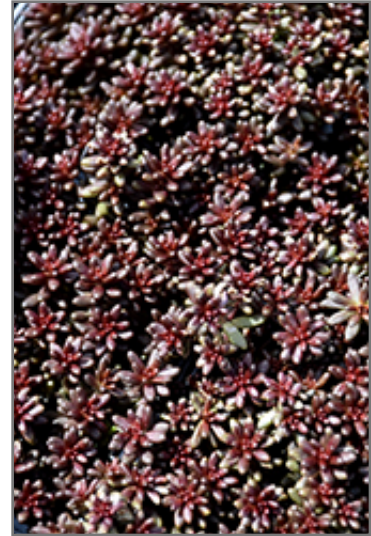
Coral Carpet Stonecrop

Coral Carpet Stonecrop is a fine choice for the garden, but it is also a good selection for planting in outdoor pots and containers. Because of its spreading habit of growth, it is ideally suited for use as a 'spiller' in the 'spiller-thriller-filler' container combination; plant it near the edges where it can spill gracefully over the pot. Note that when growing plants in outdoor containers and baskets, they may require more frequent waterings than they would in the yard or garden.