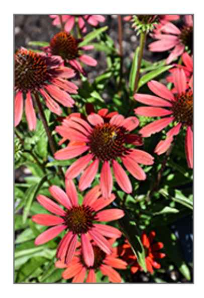
Kismet Red Coneflower flowers