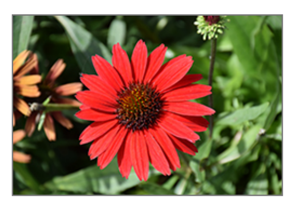
Kismet Red Coneflower flowers

Kismet Red Coneflower is recommended for the following landscape applications;