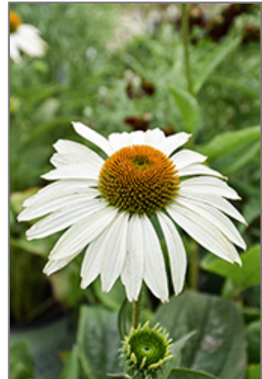
Happy Star Coneflower flowers