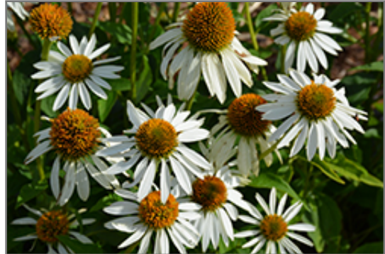
Happy Star Coneflower flowers

Happy Star Coneflower is recommended for the following landscape applications;