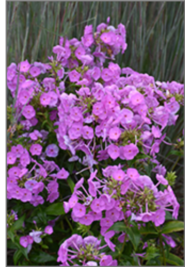
Fashionably Early Flamingo Garden Phlox flowers

Fashionably Early Flamingo Garden Phlox is recommended for the following landscape applications;